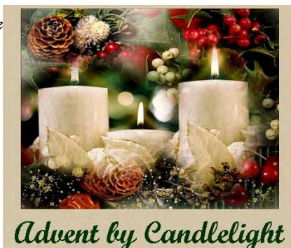
Advent by Candlelight

*Participation in the gift giving is optional.